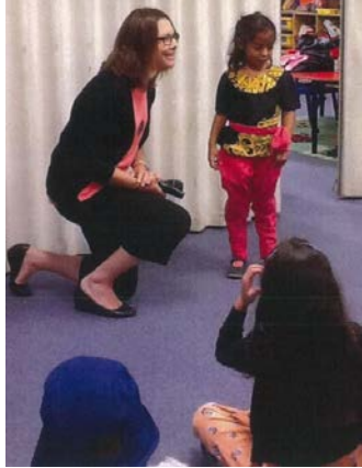
Harmony Day photos